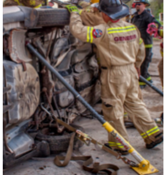
Note the rounded surface of the car body, install the strut on this side first when possible.