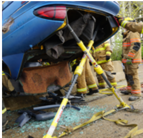
Stabilized exterior and interior of the trunk