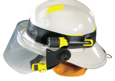
99075 Helmet Strap Hard hat and flashlight not included