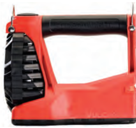
Taillight LEDs ensure you can be seen even from behind Can be programmed on or off