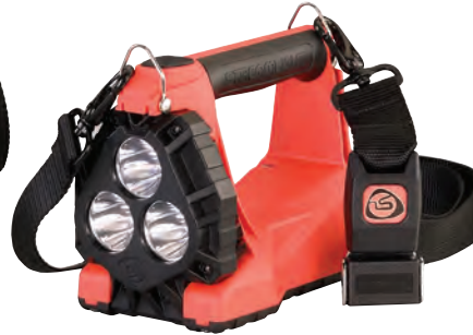
Quick-release strap works like a seatbelt buckle for fast and easy release/connection of shoulder straps