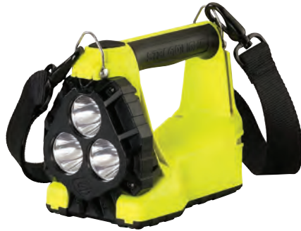
Yellow model includes heavy duty strap Configuration with quick release strap available