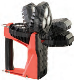
180° articulating head