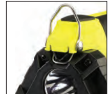
Locking mechanism keeps head in place